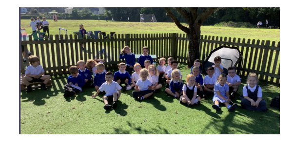
We met our Year 6 buddies

Look at all the amazing things we did in our first term at school!